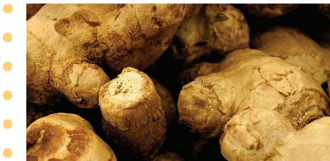
Ginger Root (Edible)